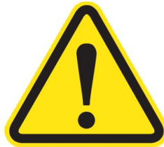
Figure 5: Example Nexus OnCore Module Refer to Manual Label

The Nexus OnCore Modules will also have a warning label applied to them as shown as Figure 3 below: