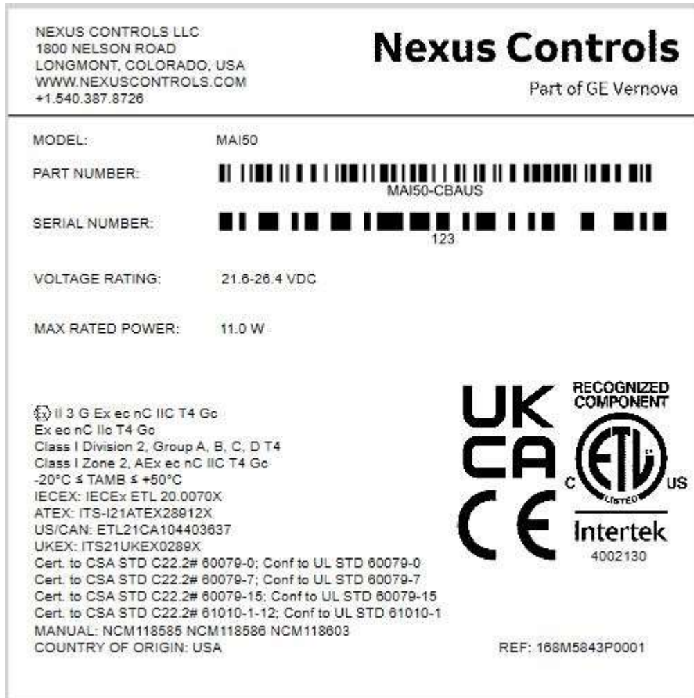
Figure 2: Example Nexus OnCore Module IECEx Nameplate for USA