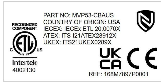
Figure 4: Example Reduced Size Nexus OnCore Module IECEx Nameplate for USA

The Nexus OnCore Modules will also have a warning label applied to them as shown as Figure 3 below: