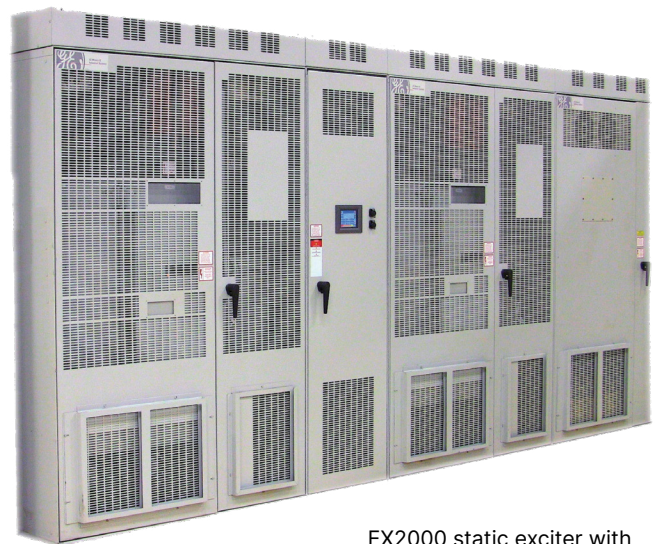
EX2000 static exciter with EX2100e Controls Migration.

Comprehensive software libraries – drawing upon years of OEM experience to ensure safety-related software updates are delivered as well as built-in generator simulator for training.