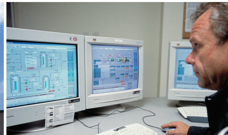
Cover Image: PSP30522-04, Inside Images: PSP30466-09, PSP30522-08, PSP30522-01, PSP30522-07