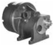
Liquid Fuel Manifold Addition

GE's global service network provides life cycle support for more than 3,500 aeroderivative gas turbines worldwide to help you meet your business challenges and success metrics – anywhere and anytime. Our global service network connects with you locally for rapid response to your service needs.