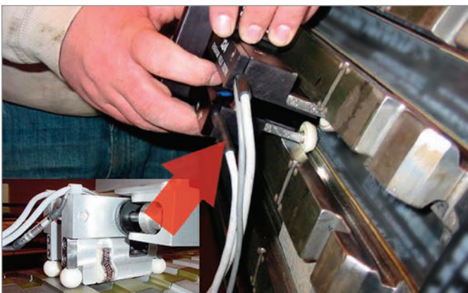
Eddy current inspection

The eddy current inspection examines the entire rotor dovetail area, and can be performed during an outage after the retaining rings and slot wedges have been removed. The test employs eddy current coil arrays on both sides of a specially designed probe, built to specific rotor dovetail dimensions, to provide complete coverage of the slot dovetail geometry. This probe configuration and the equipment utilized allows the entire length of the slot to be inspected with a single scan. The data acquired is then analyzed to provide an accurate assessment of the rotor dovetail condition.