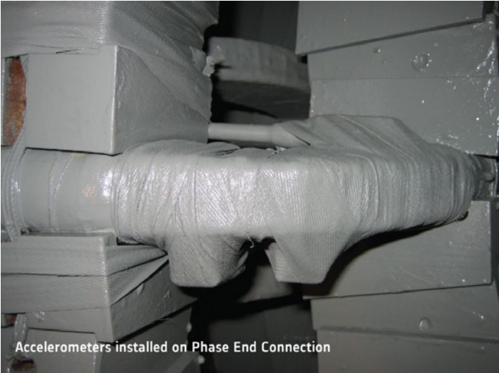
Accelerometers installed on Phase End Connection