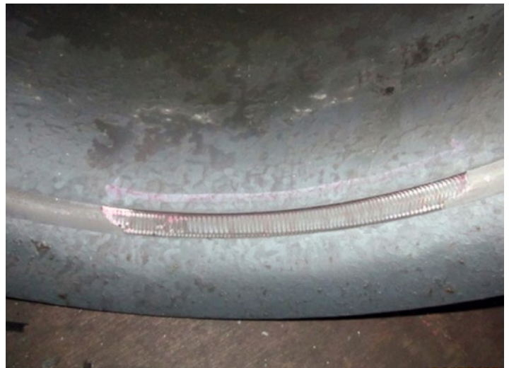
Figure 1: Cracking on the contact surface of a valve seat

To learn more about this offering, contact your GE Vernova representative or visit governova.com/gas-power