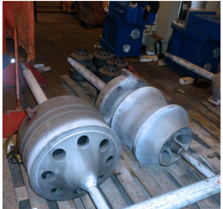
Figure 1: Valve parts awaiting maintenance

GE Vernova has established analysis and repair techniques for both temporary and long-term repair solutions. This work can be integrated with a long-term replacement or upgrade strategy.