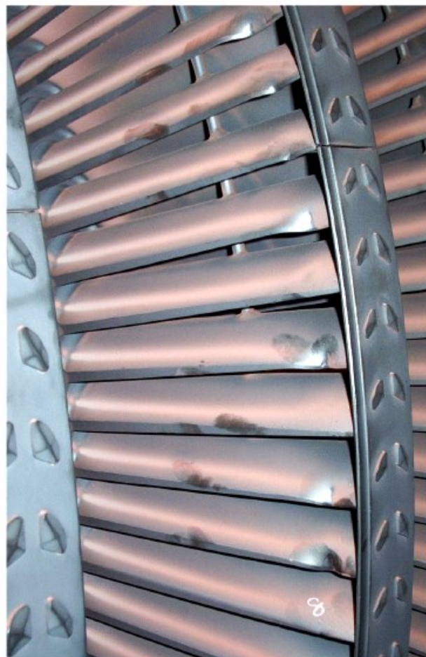
Fig 1: Blade damage on an IP rotor

For fleets from other manufacturers, GE can re-engineer the blade or parts to its exact specification and also improve upon it by modelling the expected operating conditions (Fig. 3).