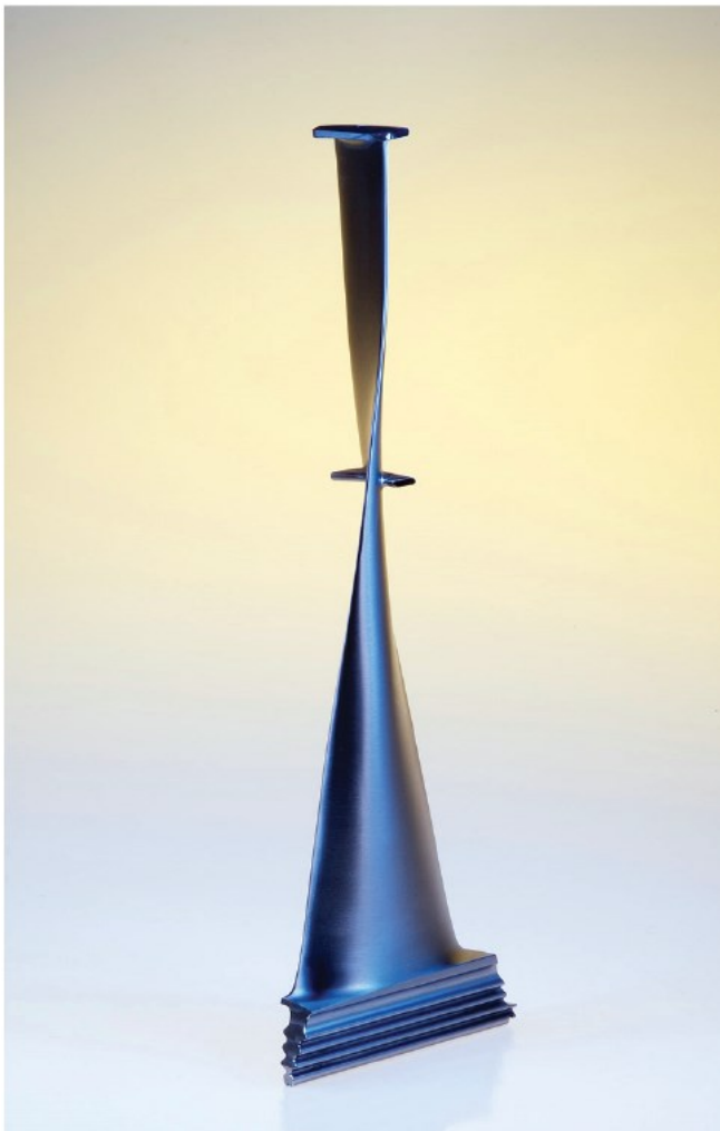
Fig 2: Last Stage Blade (LSB) for LP cylinder

Such "modular spare policy" can cover multiple units of the same technology. GE has already performed contracts for clients with fleets manufactured by GE as well as by other manufacturers.