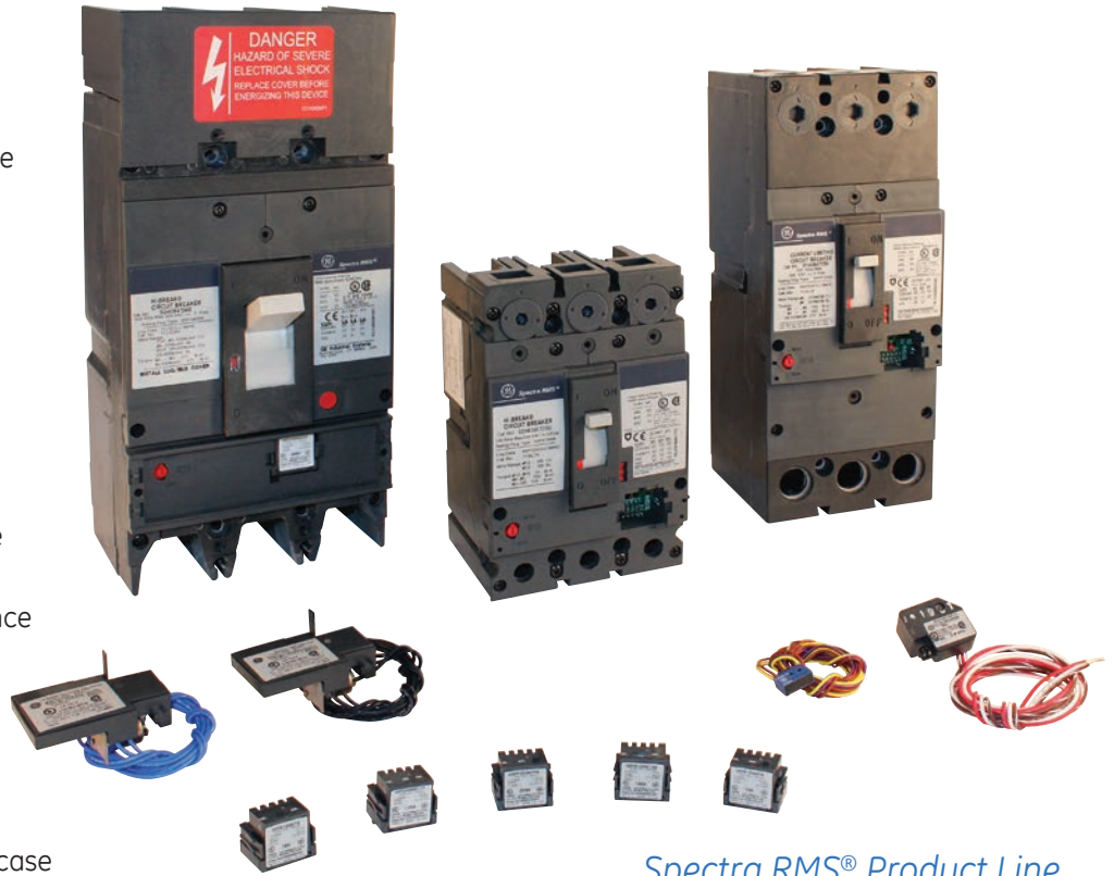
Spectra RMS® Product Line

The Spectra RMS® circuit breaker line pioneered the use of interchangeable rating plugs and universal internal accessories. With superior performance characteristics needed to meet the most demanding applications, plus a complete line of OEM accessories, GEH is certain that the Spectra RMS® line of circuit breakers, motor circuit protectors and molded case switches will be the preferred product for your nuclear application.