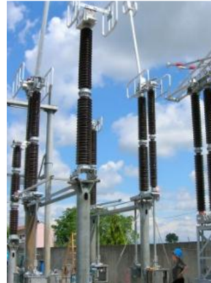
S3CVL Vertical break disconnecter