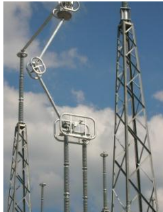
SPVL Semi-pantograph disconnecter