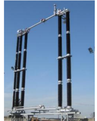
SPOL2T Knee type disconnecter

For more information please contact GE Grid Solutions