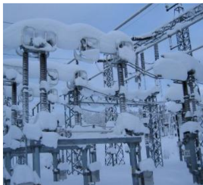
An SPOL 300 kV knee type disconnector equipped with L-Contact in extreme weather conditions in Norway

The design of each component and the choice of materials was made with the aim of ensuring total reliability even when operating under the most adverse climatic conditions.