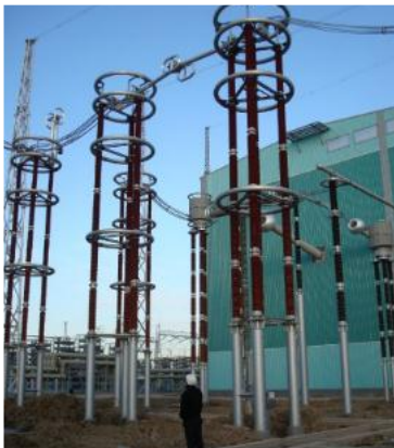
SPOL Knee type disconnecter