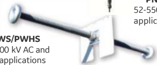
PWS/PWHS 24-800 kV AC and DC applications

For more information please contact GE Grid Solutions