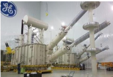
PHI hybrid bushings

All the winding machines used for condenser bushings product are computer controlled and have been specifically designed and developed for that purpose by GE.