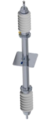
PWR/PWHR air-to-air 24-245 kV AC and DC applications