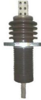
PGFR Generator bushings Up to 30 kV