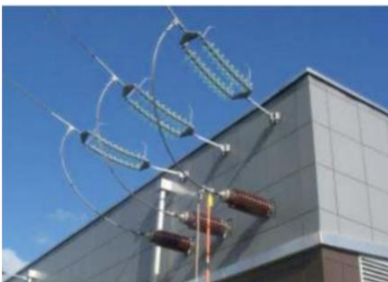
OIP wall bushings