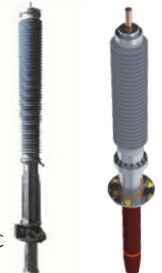
PNHR 52-550 kV DC applications