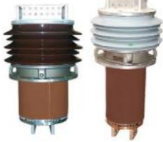
PTFR/PTHR Oil-to-high current 24-52 kV