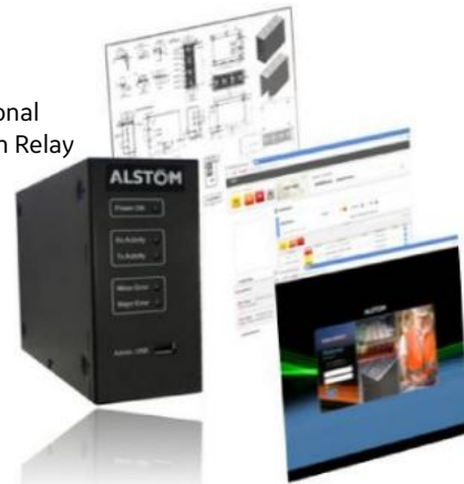
Conventional Protection Relay

The performance criteria expected by protection engineering can be set more easily with a comprehensive set of thresholds and alarm settings.