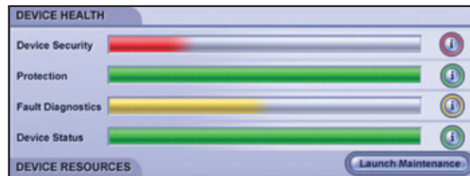
Device Health Logic