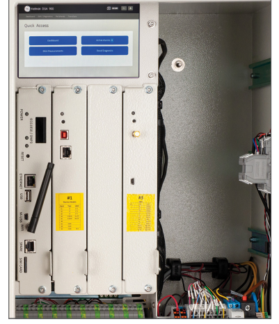
Location of maximum 3 x add-on cards

*Whichever is greater. Accuracy quoted is the accuracy of the detectors during calibration. Gas-in-oil measurement may be affected by oil type and condition. Repeatability as measured from final production test data.