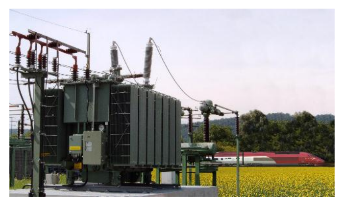
15 MVA 120/17.25 kV 16.7 Hz track-side hermetic transformers for railways

In the past decade, a German railway operator purchased large series 10 and 15 MVA hermetically-sealed Green Power Transformers with patented expandable radiators and vacuum tap changers for reduced maintenance costs, optimized overload capacities and longer life time.