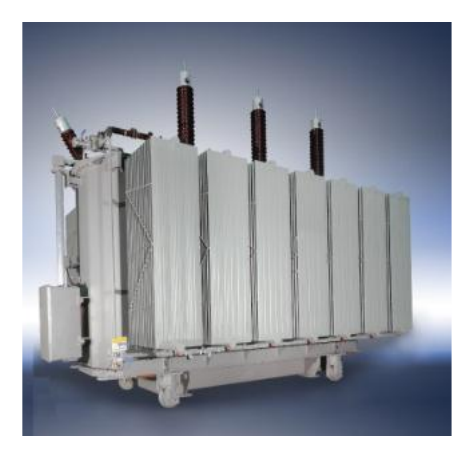
Green Power Transformer 110 kV, 31,5 MVA