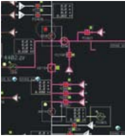
Highlighting of faulted zones, fault detectors, and switching recommendations.

When put to the test on DMS systems deployed around the world, FDIR has emerged as an extremely reliable and effective advanced fault-management system. GE Energy is a world leader in intelligent fault management and optimized restoration switching applications.