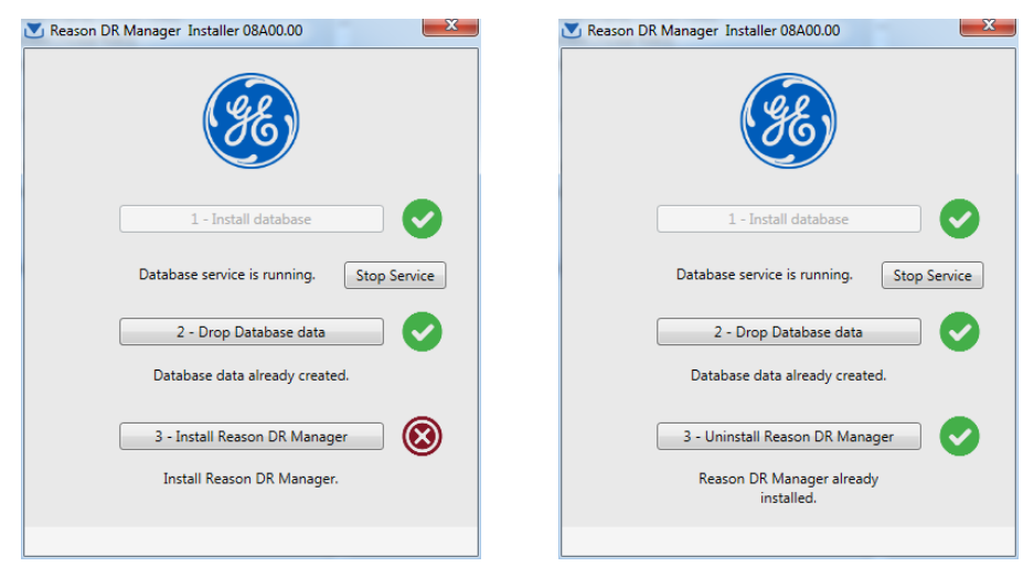
Figure 4 – Reason DR Manager Installation procedures.

All downloaded records will be located at folder configured in "Configuration -> Polling -> COMTRADE Directory and Select Directory".