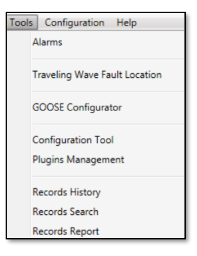
Figure 14 - Tools menu.