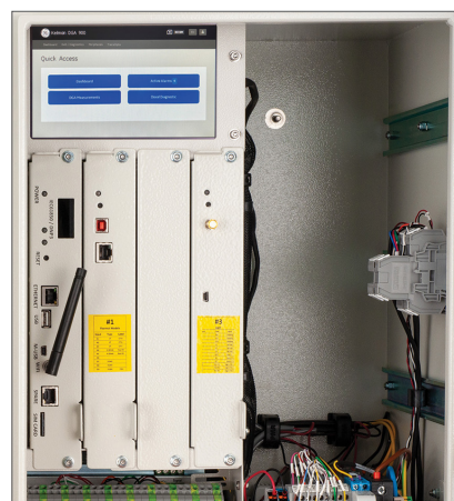
Location of maximum 3 x add-on cards