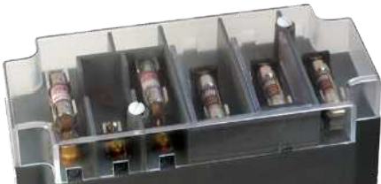
Clear Plastic Cover