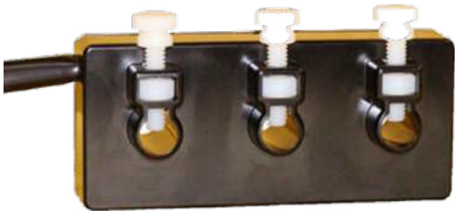
For Horizontal Mounting