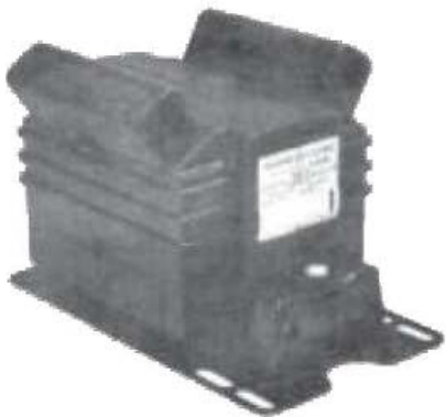
JVM-2 Voltage Transformer (two primary fuses with fuse covers)