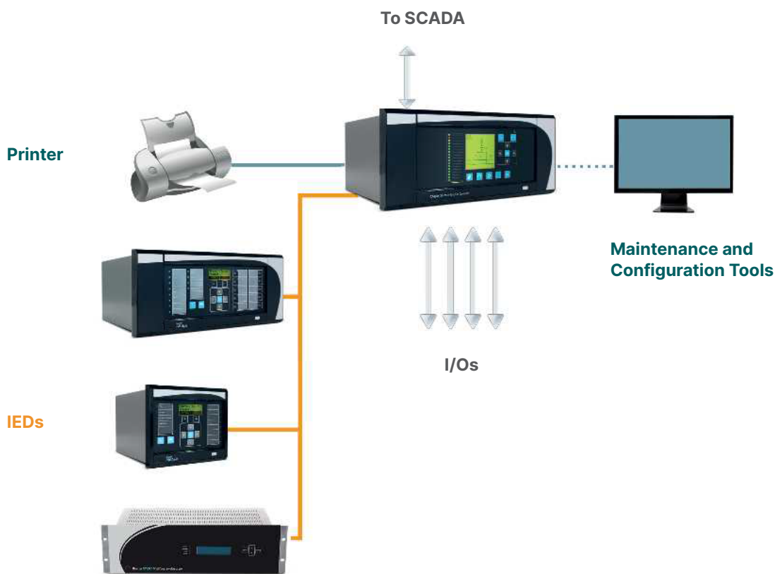
Figure 3 Simple control system architecture using a single C264 substation controller

In addition, when used as SCU, DS Agile C264 is also able to perform logic equations through Programmable Scheme Logic (PSL) to improve substation interlocks which can now only rely on field data and equipment.