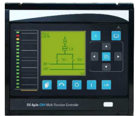
Figure 2 DS Agile C264 front view (40TE case)