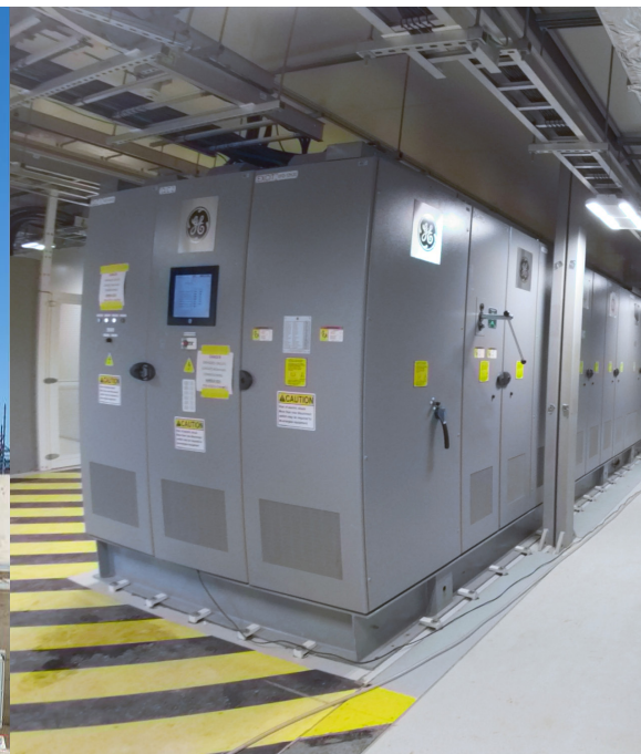
Inside an e-house