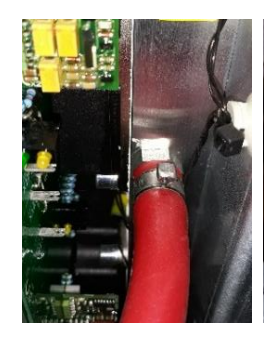
Existing hose (Silicone tube)

GE provides field service support as additional offering for the installation, testing and certification processes.