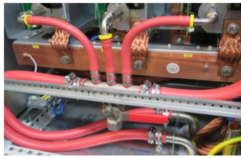
24° cone connector with O-ring seal cone (DKO-end) sealing assembly