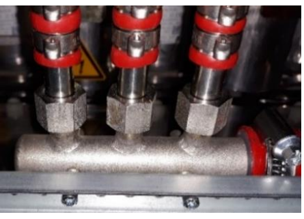
Flat sealed manifold