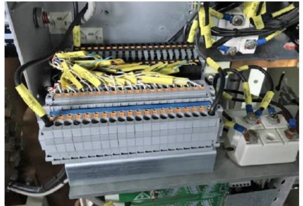
New terminal blocks with fuses (Fused TBs)