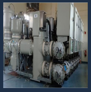
1 X 132kV GIS bay extension for OPTCL Unit VIII at Bhubaneshwar