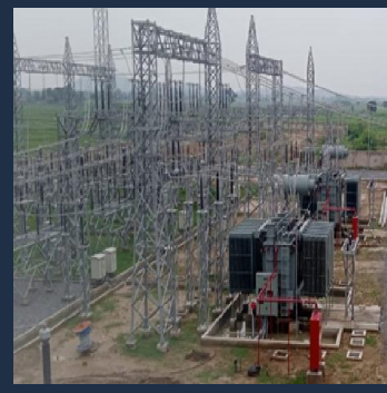
2 X 50 MVA, 132/33kV along with 9 X 33kV Bays at JUSNL at Naudiha