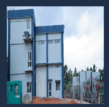
220/110kV 06 GIS Bays for KSEB at Vizhinjam