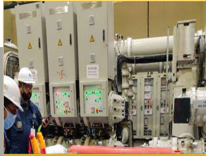
Commissioned 132 kV 40 bays of GIS for HMEI at Bhatindra