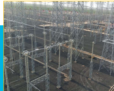
Commissioned 400 kV 03 bays & 220 kV 06 AIS bays for PGCIL at Bhuj