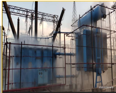
Commissioned 400kV 125 MVAR Bus Reactor for NTPC at Kahalgaon