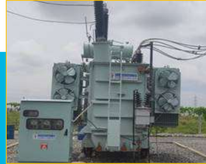
Commissioned 132 kV 2 bays for OPTCL VO of GIS Extn at Chandbali