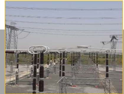
Energized 765kV 1 AIS bay for GTL ADANI Extn package at Gr. Noida