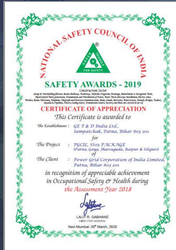
PGCIL SS03 Package

Certificate of appreciation received from