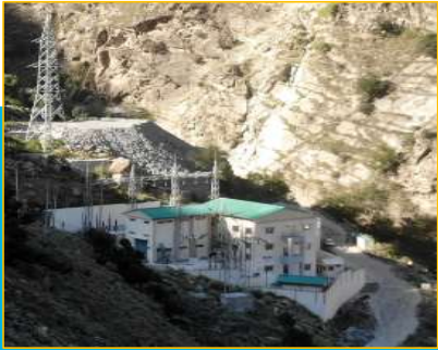
Commissioned 66 kV 5 GIS bays for HPPTCL at Urni