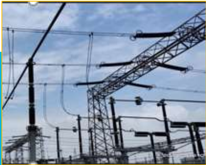
Energized 765kV 2 bays of Generator Trafo#2 with Tie Bay for NTPC, Darlipalli