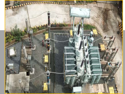
Energized 132kV 40 MVA 2 nd trafo issued by OPTCL at Bhubaneswar